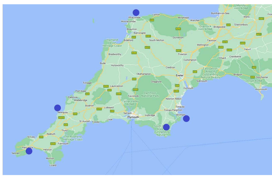
Figure 1: Map of Devon and Cornwall showing the approximate locations of the five in-person workshops (clockwise from top: Ilfracombe, Brixham, Stokenham, Newlyn and Newquay).

At the request of industry, an additional online workshop was held on 5<sup>th</sup> May. Several written submissions were also received and incorporated into this report.